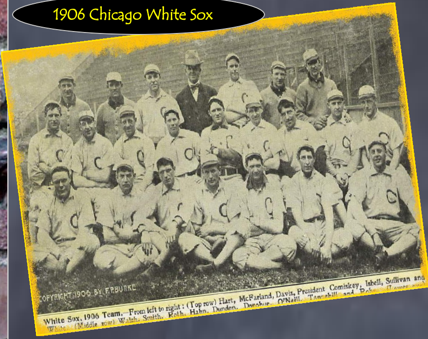
1906 Chicago White Sox